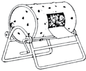
ROTATING BARREL COMPOSTER