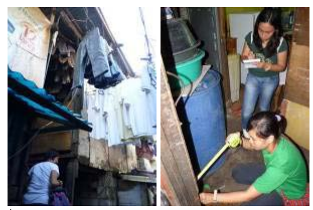
(left) One of the houses to be renovated; (right) UP-TFA students taking actual measurements of the houses