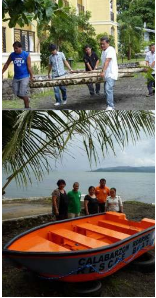
Fabricated prototypes of the bamboo raft (top) and fiberglass rescue boat (bottom)

Aside from the rescue boats, Early Warning Systems such as the ASTI-Developed Automatic Rain Gauge and ICT-based Disaster Communication were also presented. These aim to make the weather bulletins and updates accessible to the public and were developed in support of the newly enacted Republic Act 10121 otherwise known as the Philippine Disaster Risk Reduction and Management Act of 2010. (Verna Sarraga)