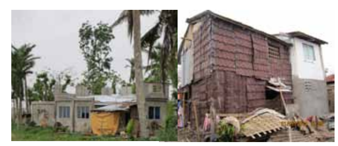
left photo: The second floor of a house made of concrete hollow blocks in Pan-Ay, Capiz was completely destroyed by typhoon Yolanda.

At the end of the NCC meeting, the following were agreed upon: 1) establishment of quick relief fund; 2) approval of e-market concept note; 3) the PMPI one year plan; 4) approval of peace constituency building; and 5) further discussion on the proposal for each cluster to have a quick disaster response team. The five-day program ended with all participants celebrating an evening mass led by Bishop Pabillo and Monsigñor Spiegel. (Angel Sales)