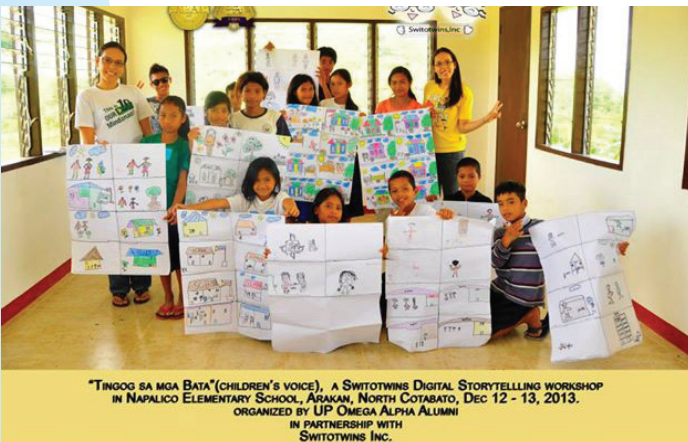
"TINGOG SA MGA BATA" (CHILDREN'S VOICE), A SWITOTWINS DIGITAL STORYTELLING WORKSHOP IN NAPALICO ELEMENTARY SCHOOL, ARAKAN, NORTH COTABATO, DEC 12 - 13, 2013. ORGANIZED BY UP OMEGA ALPHA ALUMNI IN PARTNERSHIP WITH SWITOTWINS INC.

Switotwins, Inc. teaches the children about digital storytelling in the off grid community of Arakan, North Cotabato.