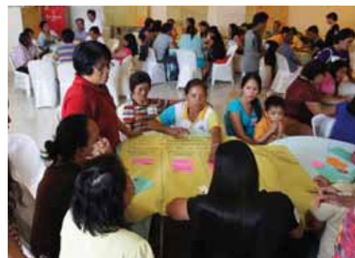
Focus groups formulate action plans for their proposed community projects.