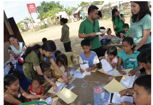
UP-TFAers teach the children of MASAGANA Community how to create handbound notebooks from scratch papers.

Members also organized some icebreaker activities in order to get to know the kids on a more personal