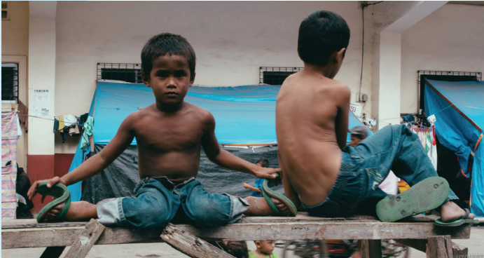
IDPs in Zamboanga. Switotwins, Inc. produces a documentary about the impact of the armed conflicts in Zamboanga to children.

But what was also very stressing was that as the demand for architects and designers to help in emergencies increased, most designers know of architecture as something that has to be imposed. This really bothered me a lot. Because one thing's for sure, in my short experience with TAO Pilipinas, a women-led technical organization that believes in the practice of participatory design, what I learned is that design for the community should not be imposed. Instead, design should and will always be participatory because designing is a form of nation building.