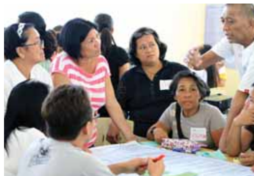
Workshop participants are divided into focus groups to discuss the pre- and post-Yolanda situation of their barangay.

The outputs from the consultation process facilitated by TAO-Pilipinas are intended to aid CRS in developing appropriate options for its program aimed towards community resilience, particularly in its household-level shelter assistance and barangay-level infrastructure support. These shall also form the baseline data for monitoring the impacts of CRS intervention on Old Sagkahan households. (GRM)