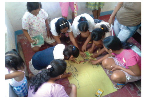
One group of women from Homonhon drawing their dream community during the visioning exercise part of the community validation in Barangay Inapulangan.

The project of PMPI in Manicani and Homonhon Islands is now focused on the long-term rehabilitation and development of the islands. A new model of cooperation is being pushed by PMPI which involves different network members from various fields of expertise coming together to rehabilitate and develop the islands within three years. In turn, TAO-Pilipinas will continue to support PMPI in this three year project endeavour. (AMPS)