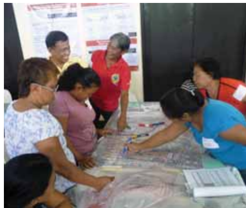
Mapping exercises are conducted to delineate hazard zones within the barangay.