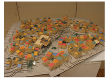
right photo: A scaled model of one of the design proposals of the students during their final presentation for their Pleasant Hills Subdivision project.