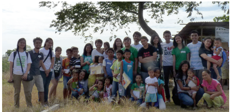
The organizers of the arts and crafts workshop with the participants from MASAGANA Community in Angat, Bulacan.