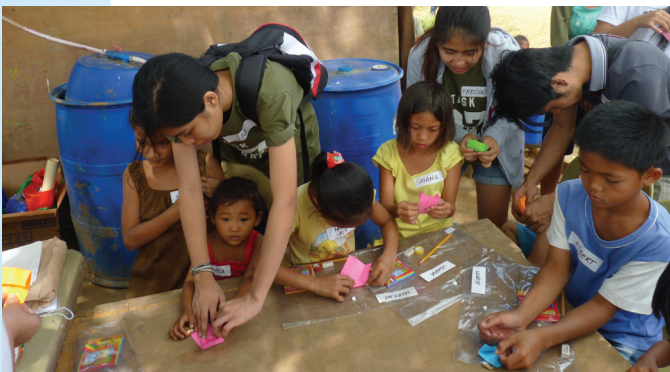
Part of the arts and crafts workshop is teaching the children origami or the art of paper folding.