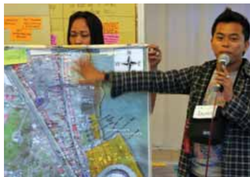
A group reporter presents the result of their FGD to the plenary.