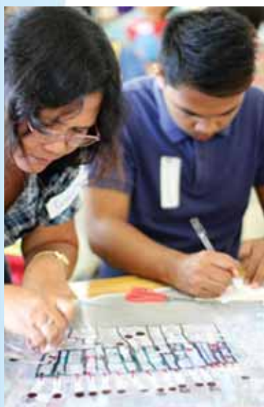
Potential areas for housing are identified and located on maps.