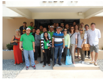
left photo: Lund University students during their site visit at Smokey Mountain Resettlement project in Balut, Tondo, Manila. (Photo by Johnny Astr  nd)

The Urban Shelter course ended in May with the students' presentation of their final design proposals that ranged from simple clustered multi-family housing to medium scale mixed-use developments that effectively integrated social, economic, and environmental aspects with the architecture and planning in the design. Sustainability, disaster resiliency and energy efficiency were also special features that were echoed in almost all of the housing development proposals. (MFYV)