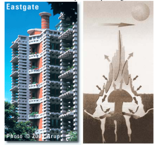
The Eastgate building in Harare, Zimbabwe and a diagram of the structure of an African termite mound.