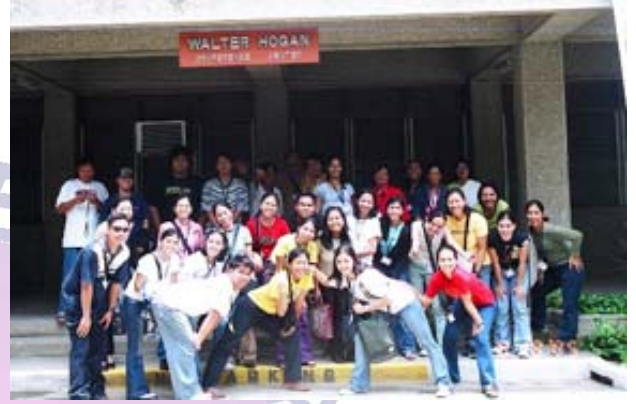
Participants of the 2005 YP Workshop at the Walter Hogan Conference Center in Ateneo de Manila University

The goal of creating more sustainable communities continues to be the main thrust of the Young Professionals Orientation and Training Program (YP-OTP) activities. For this year, the YP Workshop will focus on one aspect of sustainability, that of disaster resilience. Sustainable communities have the capability cope with changes that time brings, including from the impact of inevitable natural occurrences like typhoons, floodings, and earthquakes.