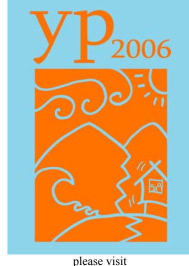
www.ypws.tao-pilipinas.org for more workshop information

TAO-Pilipinas will again organize the YP General Orientation Workshop on Social Housing on October 17-21, 2006, to coincide with the college semestral break and the month-long celebration of World Habitat. The theme for the 2006 YP Workshop is: "YPs working towards Sustainable Communities: Integrating Community-based Disaster Risk Management in Social Housing".