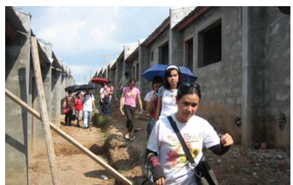
UP-TFAers inspect the core housing units at the Rodriguez, Rizal resettlement site.

among those affected by the Pasig River Rehabilitation Project. After years of struggle for security of tenure, DSOP has successfully negotiated with PRRC for near-city resettlement and a number of families will be relocated to the Rodriguez, Rizal resettlement site with standard 22-square meter core housing. The need for future house improvements and extensions has been articulated by the families to be relocated and UPTFA has volunteered to come up with design alternatives to guide the families in doing incremental improvements on the housing units in the resettlement site. Scaled models of various house design options have been generated by UPTFA and will be presented to DSOP.