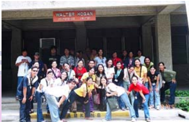
Participants of the 2005 YP Workshop at the Walter Hogan Conference Center in Ateneo de Manila University

The goal of creating more sustainable communities continues to be the main thrust of the Young Professionals Orientation and Training Program (YP-OTP) activities. For this year, the YP Workshop will focus on one aspect of sustainability, that of disaster resilience. Sustainable communities have the capability cope with changes that time brings, including from the impact of inevitable natural occurrences like typhoons, floodings, and earthquakes.