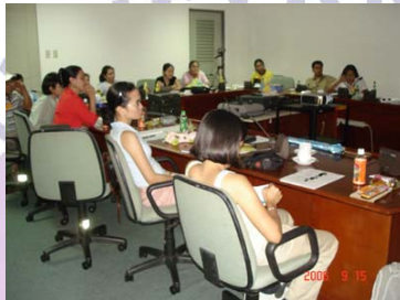
The 2005 REINA project team of PHIVOLCS presents multi-hazard maps of Quezon Province