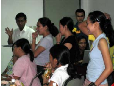
Director Solidum explains to TAO staff the use of various hazard maps to assess hazard-prone areas