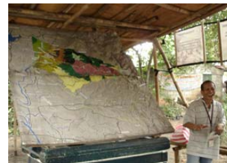
Ka Noli Abinales of Buklod-Tao presents the 3-dimensional relief map of San Mateo's Land Use Plan

Buklod-Tao is a people's organization of Bgy. Banaba residents in San Mateo, Rizal whose mission is to strengthen the capability of its members in coping with disasters and in protecting the environment. The group was organized in the late 90s primarily as an advocate for more environment-friendly development in response to the proliferation of medium and light-use industries in Rizal Province. Today, the Buklod-Tao association is considered as a model for community-based disaster management, with water-level monitoring and early warning systems in place. It also conducts rescue and relief operations and assists other communities in disaster preparedness activities. During the 2006 YP Workshop on October 18, the workshop participants will visit the Buklod-Tao community.