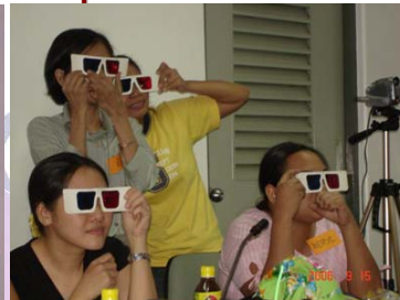
TAO staff view the 3D relief maps of Quezon presented by PHIVOLCS through special lenses

As part of the preparations for the 2006 YP Workshop, TAO-Pilipinas requested from PHIVOLCS a briefing on its Real-Infanta-General Nakar or "REINA" Project where multi-hazard maps were generated for the municipalities most heavily affected by the December 2004 flashfloods and landslides in the province. The REINA project, which was completed in 2005, was a multi-agency undertaking by PHIVOLCS, PAGASA and DENR-MGB with funding assistance from UNDP.