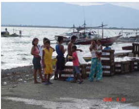
Left: The Dinahican fishport in Infanta; Right: TAO staff with PO leaders in Munting Sabang, Bgy. Dinahican, Infanta